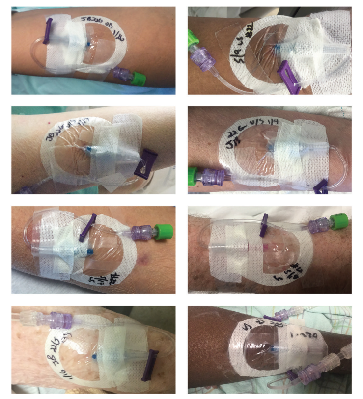
Figure 2 Future State: Standard Work, EVB-Best Practice